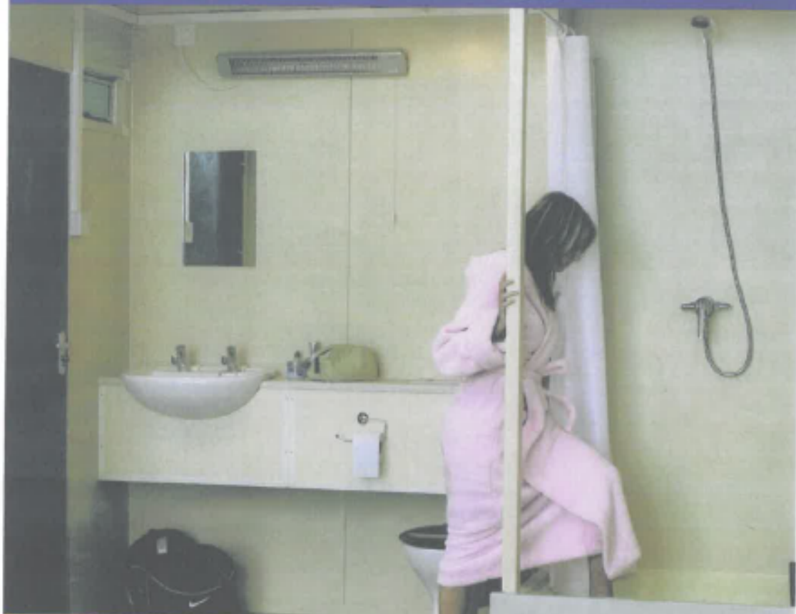
Versatile unisex shower and toilet facility