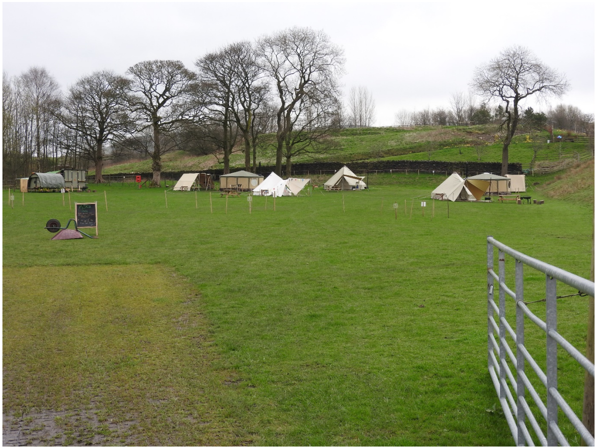
Yurts, bell tents & camping pods