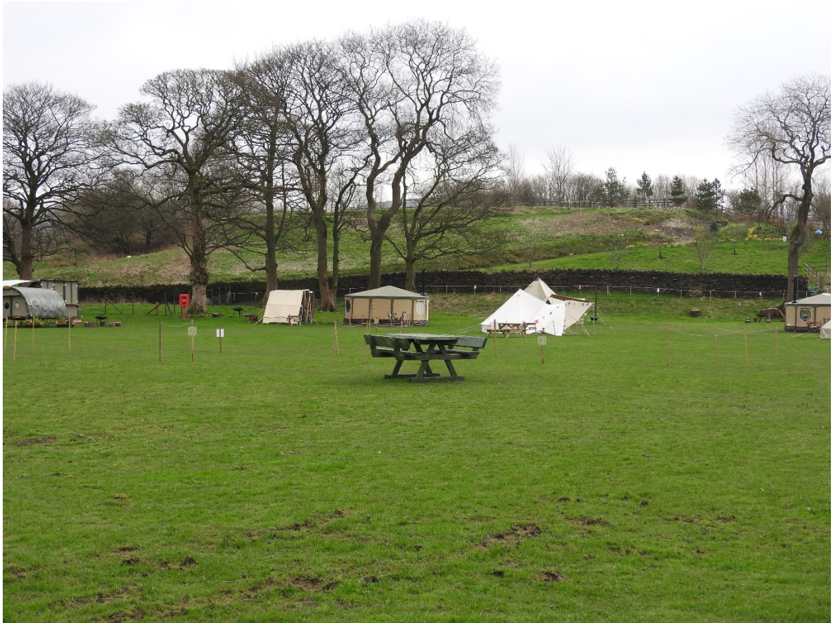
Pitches marked up