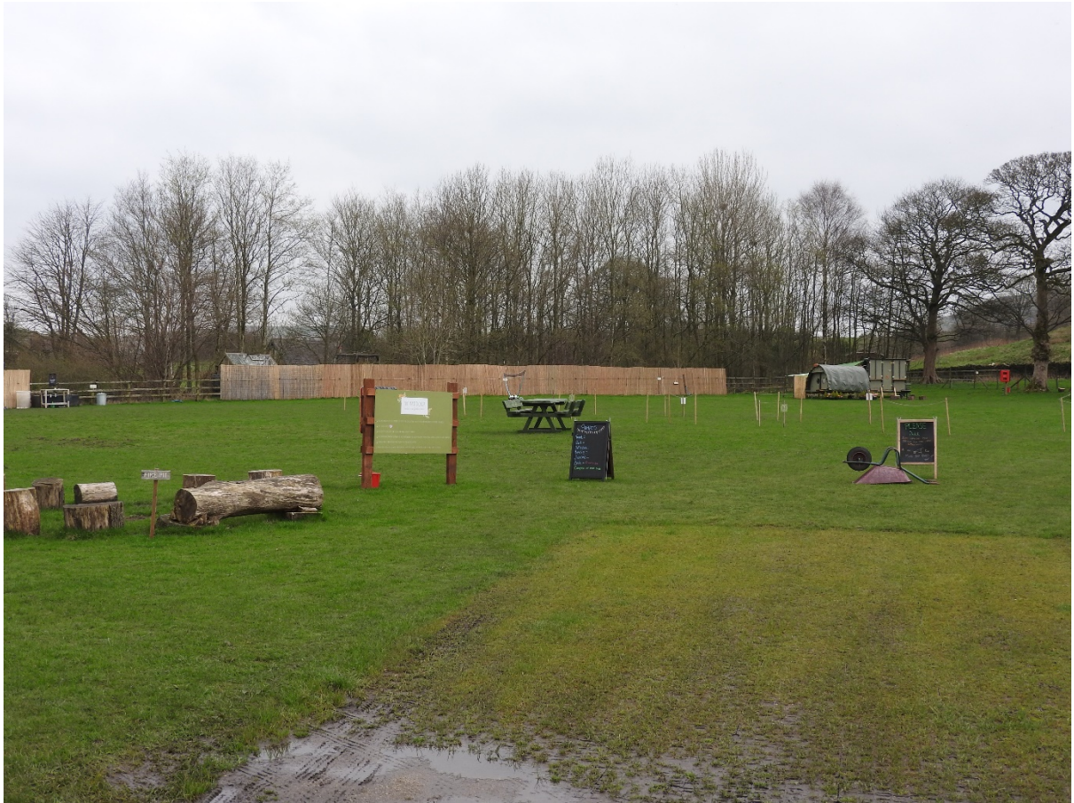
Tent pitches marked up