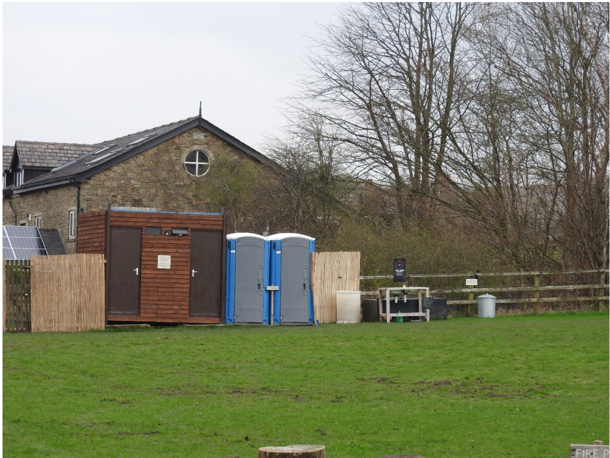
Toilets, showers, washing point & waste bins.